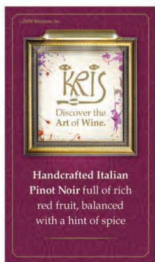
Neck Hanger 2.5" x 4.25"