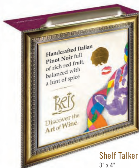
Shelf Talker 3" x 4"